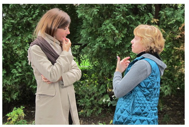
Psychology Department Kick-Off Party

Thank you for your time, UPA Executive Board 2009-2010